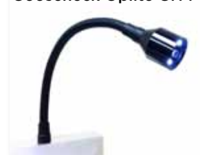
Gooseneck Oplite GN4

Any of our rugged, top-quality Oplite brand lighting products are a great addition to your custom-built aircraft.